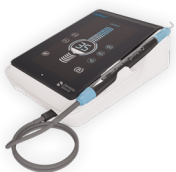
Cavitron® 300 Series