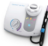
Cavitron® Jet Plus