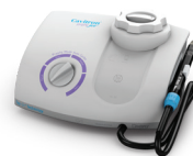
Cavitron® Prophy Jet®