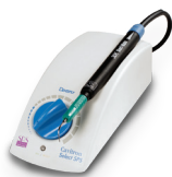
Cavitron® Select™ SPS™